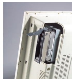
Removable 3.5" HDD bay

Customers can choose from three optional types of standardized touchscreens: resistive, capacitive and SAW (Surface Acoustic Wave). These options make the PPC-174T a more user-friendly interface for different environments.