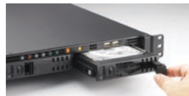
Dual front-accessible SATA HDD trays