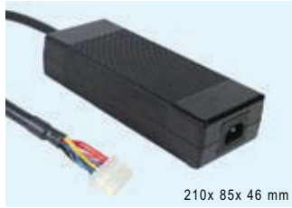
210x 85x 46 mm