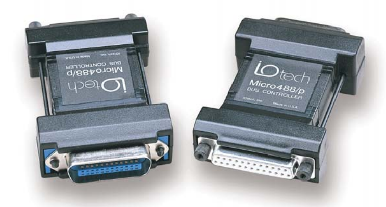
The low-cost Micro 488/p enables IEEE 488 control from any computer equipped with a serial port