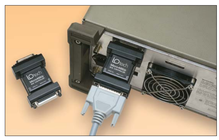
The Micro 488/p attaches directly to an instrument's IEEE 488 connector