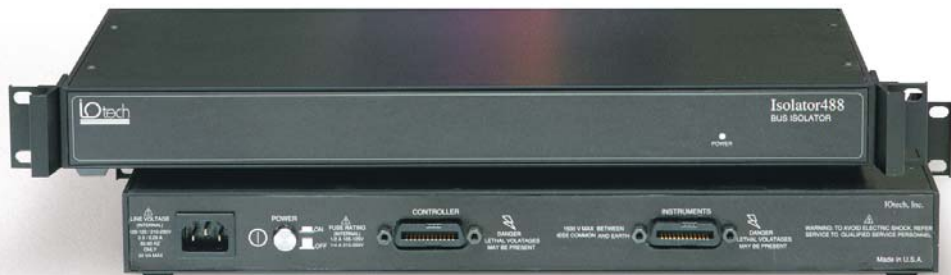
Electrically isolate instruments on the IEEE bus with Isolator488

Isolator488™ allows electrical isolation between devices on an IEEE bus by the use of opto-isolators on all the IEEE bus lines. Isolator488 does not occupy an address on the IEEE bus and is completely transparent to the system. The unit's isolation rating is a full 1500V, unlike typical IEEE bus expanders which offer only 20 or 30V isolation.