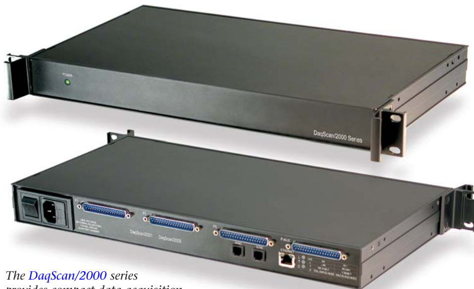
The DaqScan/2000 series provides compact data acquisition capability for Ethernet-based test systems

All DaqScan models are packaged in 1U high full-rack package, and include a rack-mount kit that can attach to either the