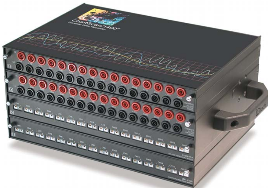
ChartScan/1400 provides measurement and control

The ChartScan/1400™ is a compact voltage and temperature recorder that can be used as a paperless chart recorder or as a data logging and control instrument. The convenient safety jack, subminiature plug, and screw-terminal connectors make signal connection easier than other data recorders or loggers. The system offers high-speed, high-channel counts, voltage isolation, and user-selectable signal conditioning.