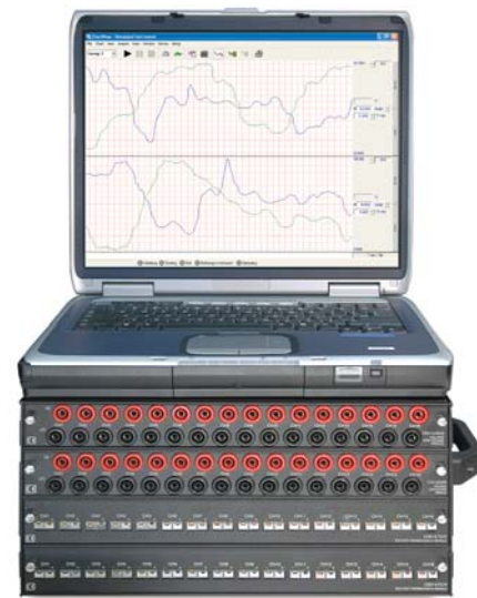
The ChartScan/1400 portable recorder is ideal for making isolated temperature and voltage measurements (notebook PC not included)

The ChartScan/1400 includes ChartView , one of IOtech's Out-of-the-Box™ , Windows-based setup and acquisition applications. ChartView provides a graphical spreadsheet-style user interface that lets you easily configure your hardware, acquisition, and display parameters. ChartView features a no