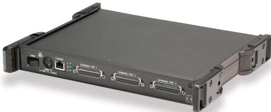
The WBK25 includes one 10/100BaseT Ethernet port and three high-speed parallel ports

If the WBK25 is attached to a shared Ethernet network, then data transfer rates will be dependent on the other network traffic at the time. It is not possible to guarantee maximum data transfer rates in this mode. However, the WaveBook offers internal memory options (WBK30 series) for applications such as this, so that the acquired data can be locally stored in the event that the shared network traffic prohibits the WaveBook from transferring data at the same rate at which it was acquired.