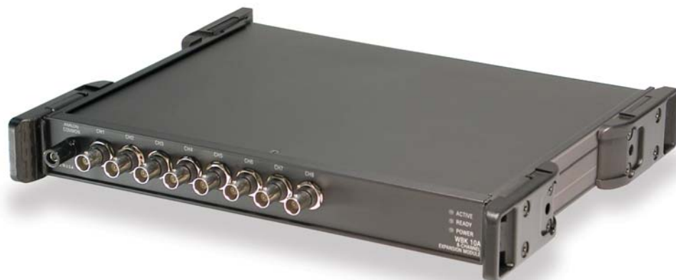
The WBK10A adds eight differential analog inputs to your WaveBook system

The WBK10A has a small form factor, letting you expand your system without expanding your space requirements