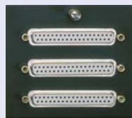
DB37-style termination panel (DBK608) features three standard 37-pin female connectors