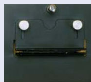
Slotted panel with adjustable clamp that holds wires in place (DBK607)