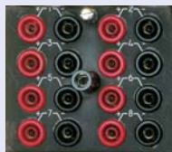
Safety-jack termination panel offers 16 connectors (Red and black jack-pairs, DBK604 shown)