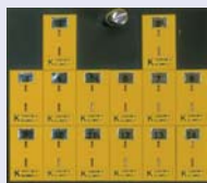
Thermocouple termination panel (DBK605) features 14 connectors for types J, K, and T thermocouples