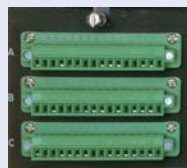
Removable-block screw-terminal termination panel (DBK606) offers 48 convenient connections