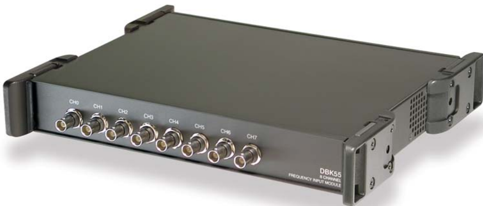
The DBK55 provides eight frequency inputs

The DBK55™ frequency-input module provides IOtech's data acquisition systems with eight channels of frequency-measurement capability. The module measures the input signal's frequency and converts the frequency to a voltage, which can then be measured by the data acquisition system. The DBK55's output is read by the data acquisition system along with any other analog channels included in the analog scan group, allowing easy correlation of readings from the DBK55 with other test parameters. The DBK55 is particularly useful for making RPM measurements in applications such as automotive testing or the monitoring of flow meters. As many as 32 DBK55 s can be connected to one data acquisition system for a total of up to 256 channels. The DBK55 accepts low- and high-level analog signals, as well as digital signals.