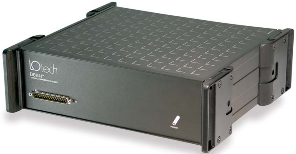
The DBK41 analog expansion module accommodates various analog signal conditioning and expansion cards in one system

The DBK32A™ can obtain its power from a number of sources: an included AC adapter, an optional DBK30A rechargeable battery/excitation module, DBK34 battery/UPS module, or any 9 to 20 VDC source, such as an automobile battery.