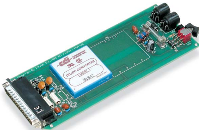
The DBK32A provides additional power for LogBook and Daq systems when the power expansion needs exceed the built-in capacity of the mainframe

The DBK32A can be installed directly into a DBK10, DBK41, or DBK60 expansion enclosure. Each is compatible with all DBK cards and is powered via an included AC adapter, a DBK30A™ battery/excitation module, a DBK34A™ battery/UPS module, or any 9 to 18 VDC source.