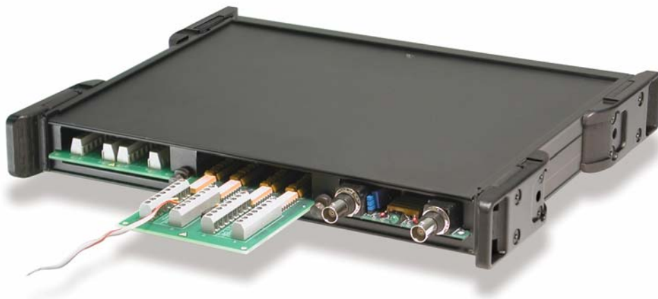
The DBK10 provides three slots for IOtech's DBK expansion cards

Weight: 1.3 kg empty (3 lbs); cards 0.25 to 0.75 kg each (8 to 12 oz)