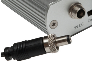
Locking Power Connector

*Achievable USB 3.0 Extension by Multimode Fiber Class