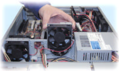
4x8cm Hot-swappable System Fans in the middle

Up to 2 pieces of fan controller for eight 3pins hot-swappable fans with fan alarm