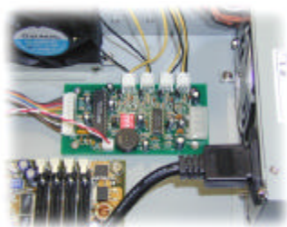
Fan Control Board