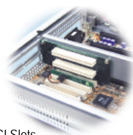
Riser Card with 2 PCI Slots