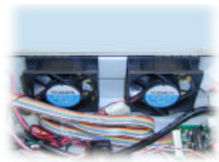
2x8cm System Fans at the right-side of chassis