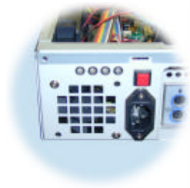
1x6cm System Fans at the back