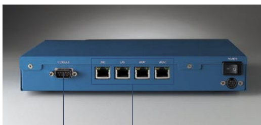
RS-232 console port Four LAN ports