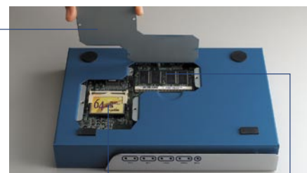
CompactFlash socket SDRAM socket