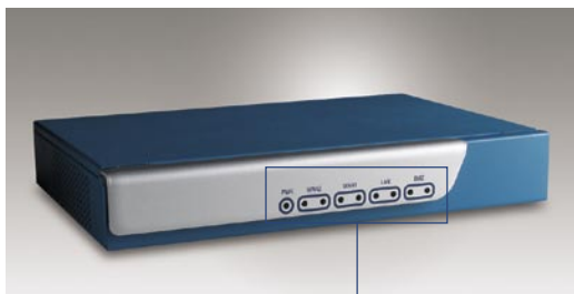
Nine LED indicators (Power x 1, LAN x 4)